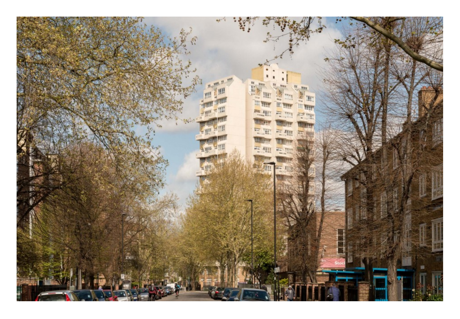
Binfield Road, London SW4