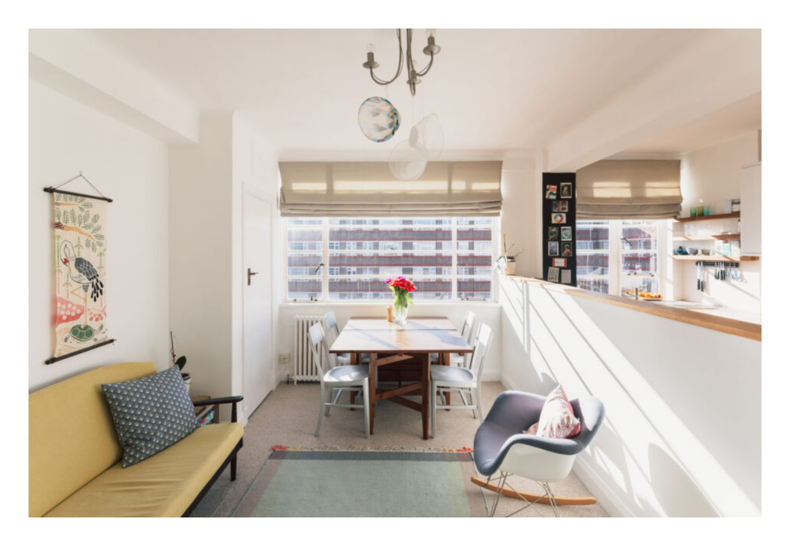
Balham High Road, London SW17