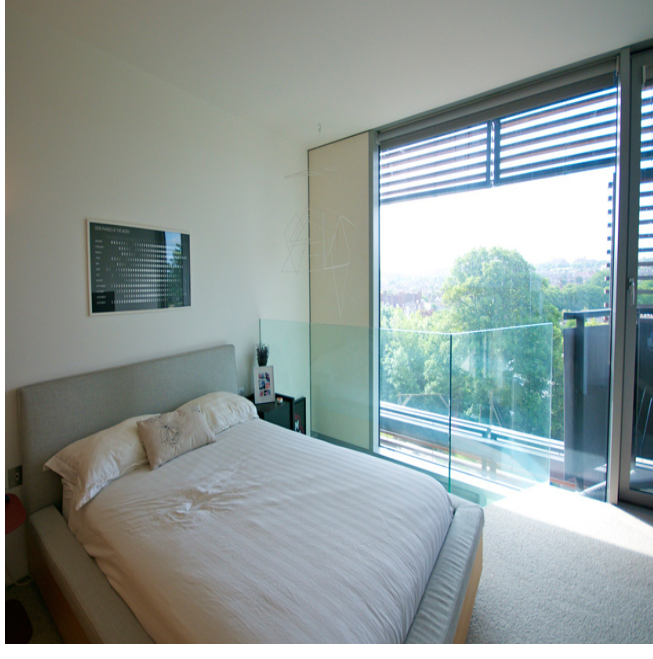
London, South London Sold