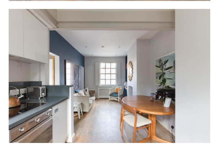
East London, London £400,000 Leasehold