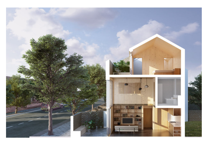
London, South London