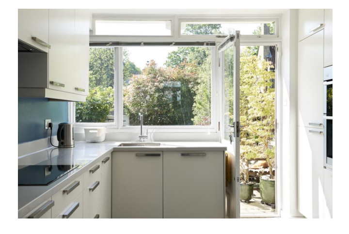
London, South London