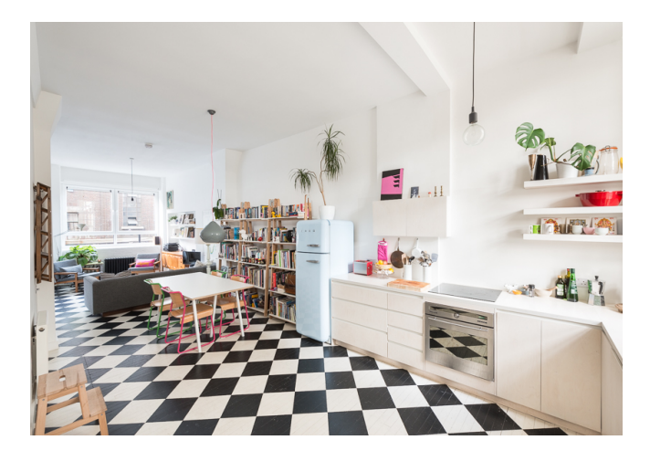
East London, London Sold