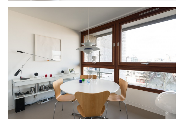
East London, London Sold