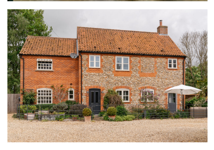
East Anglia £1,170,000 Freehold