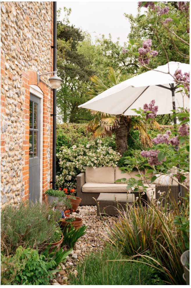
East Anglia £1,170,000 Freehold