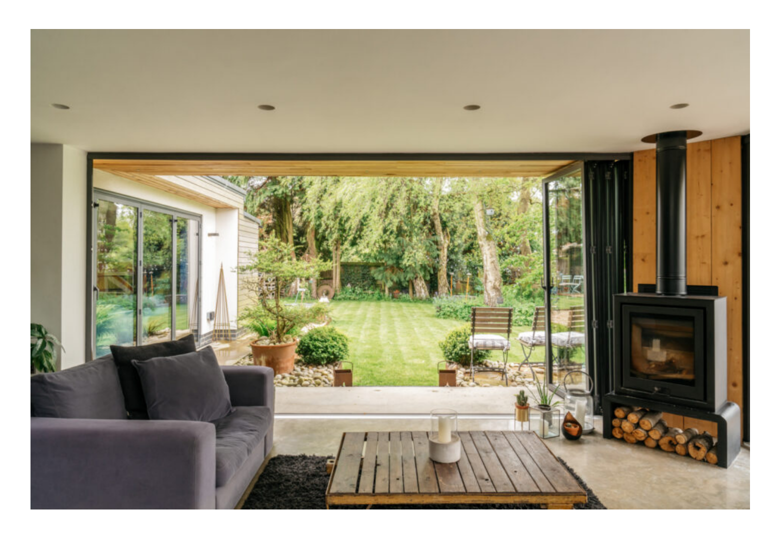
East Rudham, Norfolk £1,170,000 Freehold