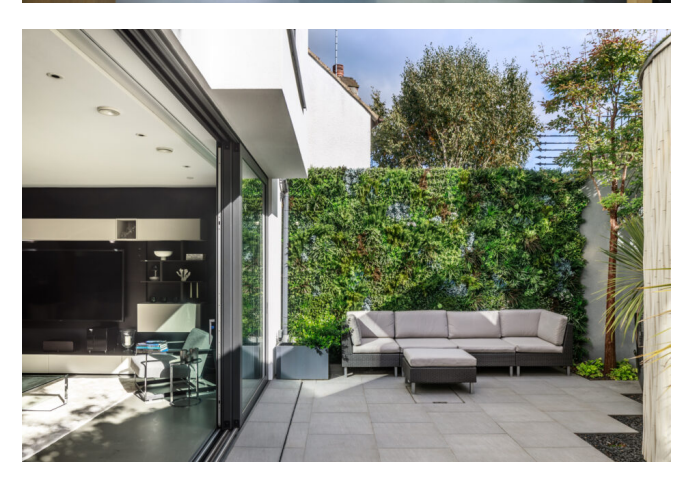
London, South London