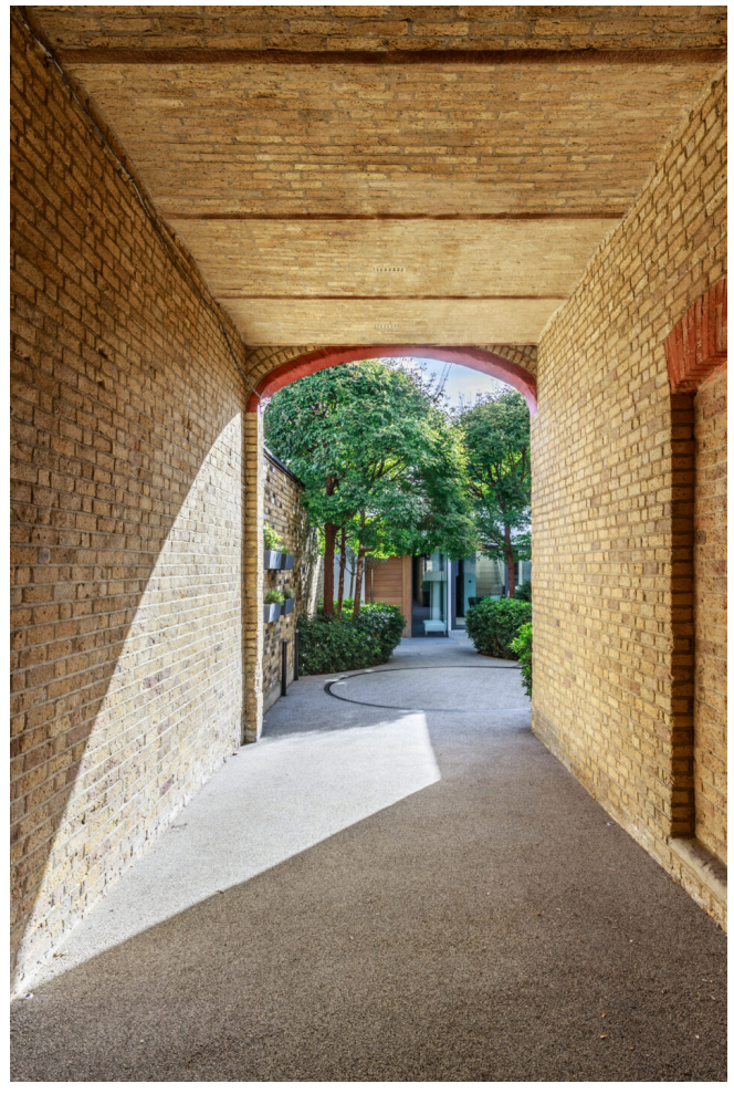
{\it London, South London} \\ {\it Sold}