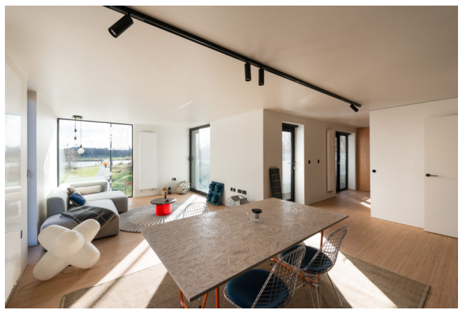
London, South London Sold