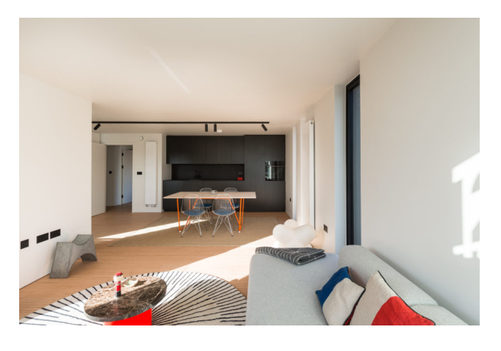
London, South London Sold