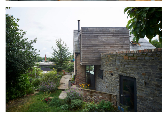
South-West England Sold